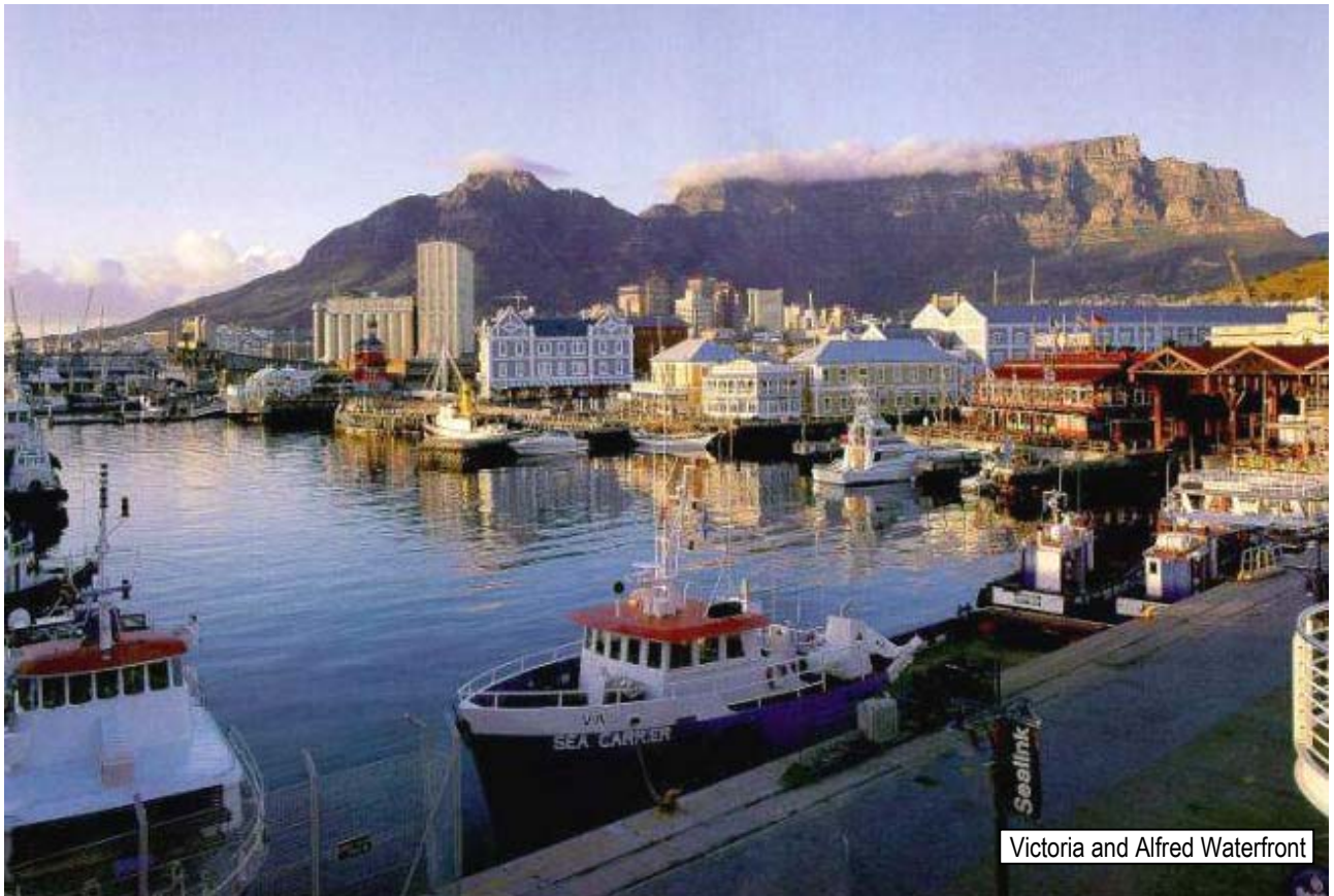
Victoria and Alfred Waterfront