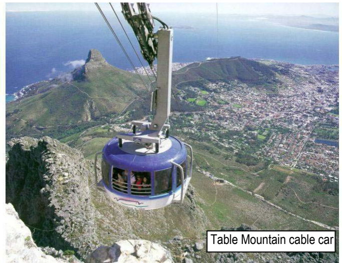
Table Mountain cable car

Sponsors who provide R 100 000 or more will be acknowledged as Main Sponsors , receive particular prominence and be provided with special advertising opportunities. The Organizing Committee should be contacted in this regard.