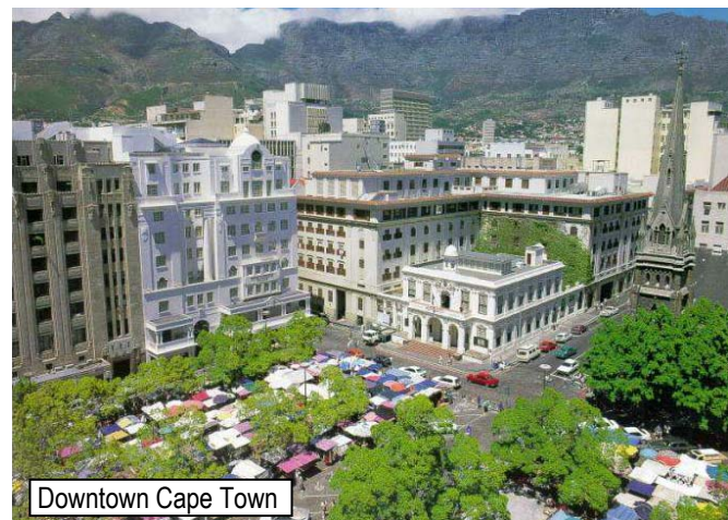
Downtown Cape Town